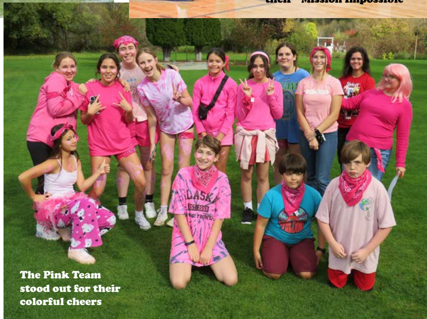
The Pink Team stood out for their colorful cheers