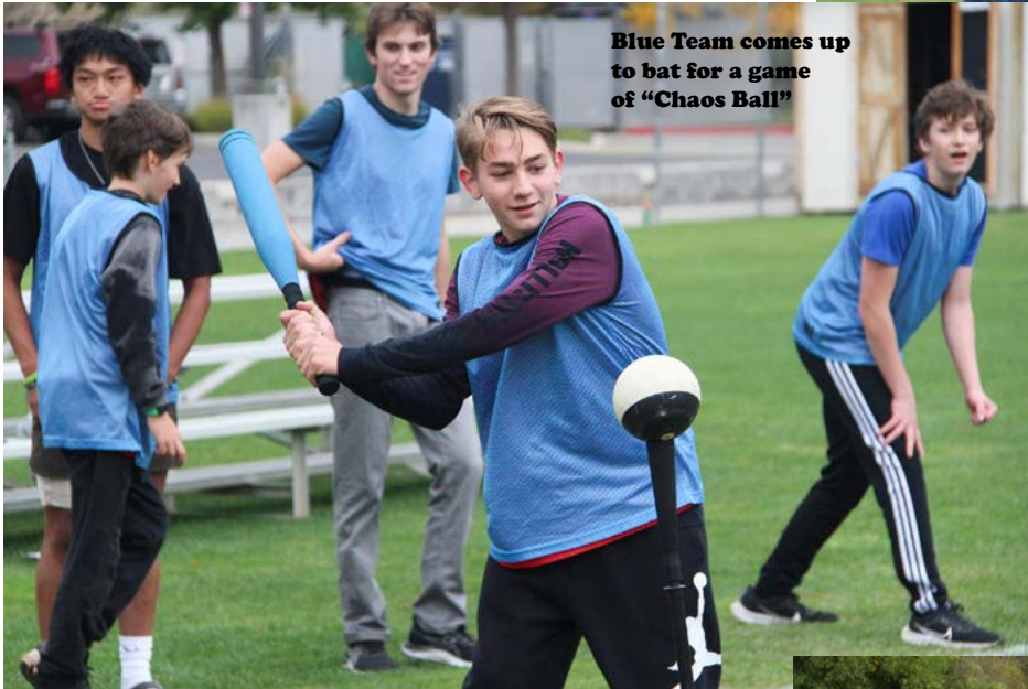
Blue Team comes up to bat for a game of “Chaos Ball”