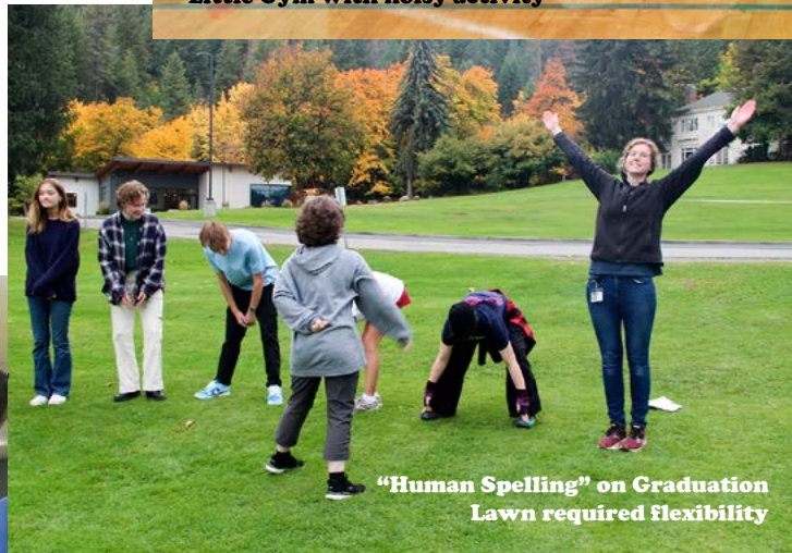
"Human Spelling" on Graduation Lawn required flexibility

"The Middle School students might feel a bit intimidated by the Upper School students at first, but they really become a team when playing these unique field games. The older students jump into the role of mentors and cheerleaders for the younger students."