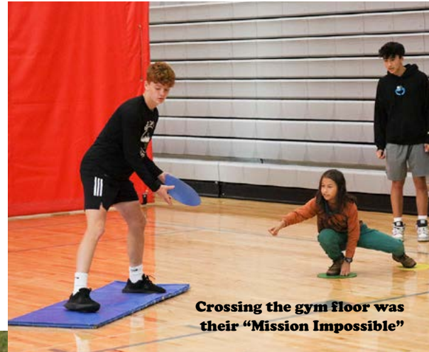
Crossing the gym floor was their “Mission Impossible”

“What I hoped to accomplish with Field Day was to create a fun and competitive environment for our middle and upper school community members to work and play together. The afternoon was a success quite simply because of those people who showed up and brought amazing energy. The students, faculty, and staff who were present created the proper vibe to ensure a great afternoon of games!”