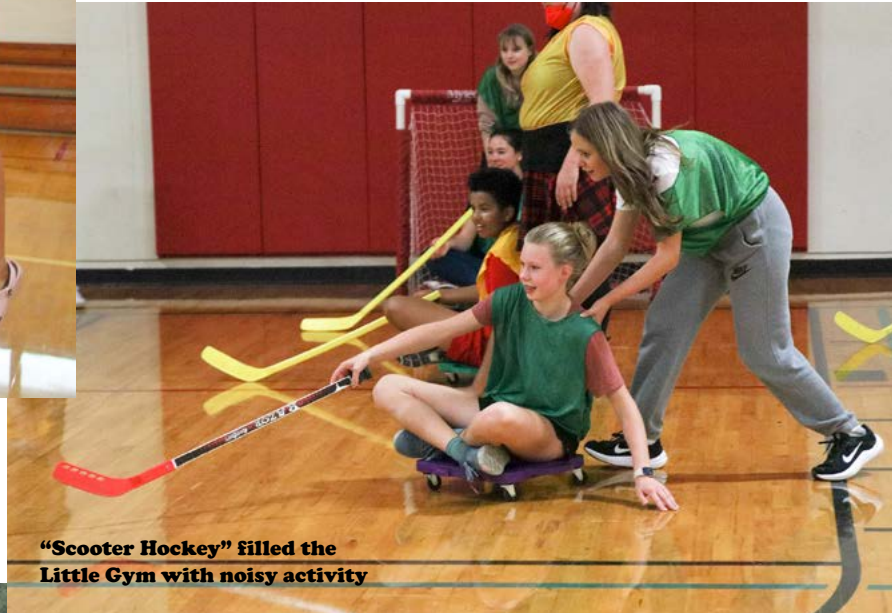
"Scooter Hockey" filled the Little Gym with noisy activity