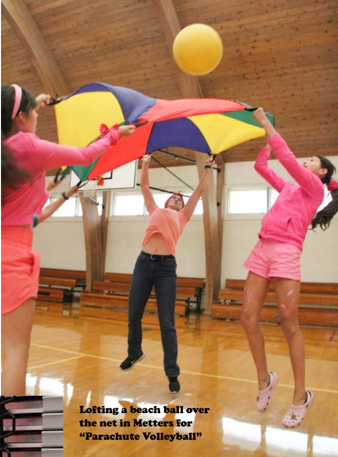
Lofting a beach ball over the net in Metters for "Parachute Volleyball"